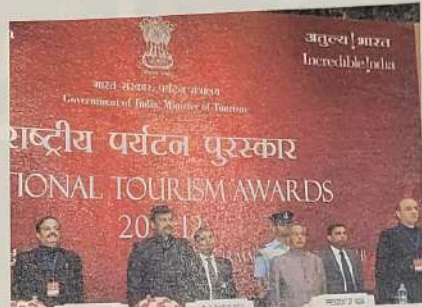
National Tourism Awards 2011-12 ceremony at Vigyan Bhavan, New Delhi