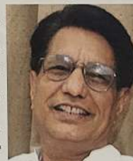
Ajit Singh Union Minister for Civil Aviation

New policy is in the offing which will boost operations from regional airports, says Ajit Singh, Union Minister for Civil Aviation.