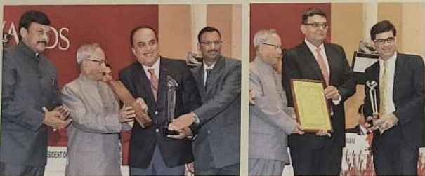
President Pranab Mukherjee presented the National Tourism Awards for the year 2011-12 to Select World Tours and Kuoni Travel. Every year, the Ministry of Tourism presents these awards to felicitate efforts put in by stakeholders in the tourism sector. This year, 86 awards were presented in 36 different categories