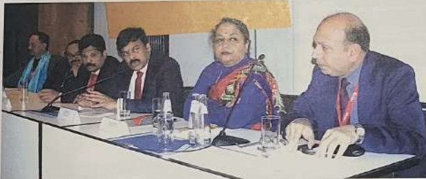
K Chiranjeevi addressing the press at ITB 2013, while other dignitaries look on

The move is in line with the ministry's ambition to garner one per cent of global