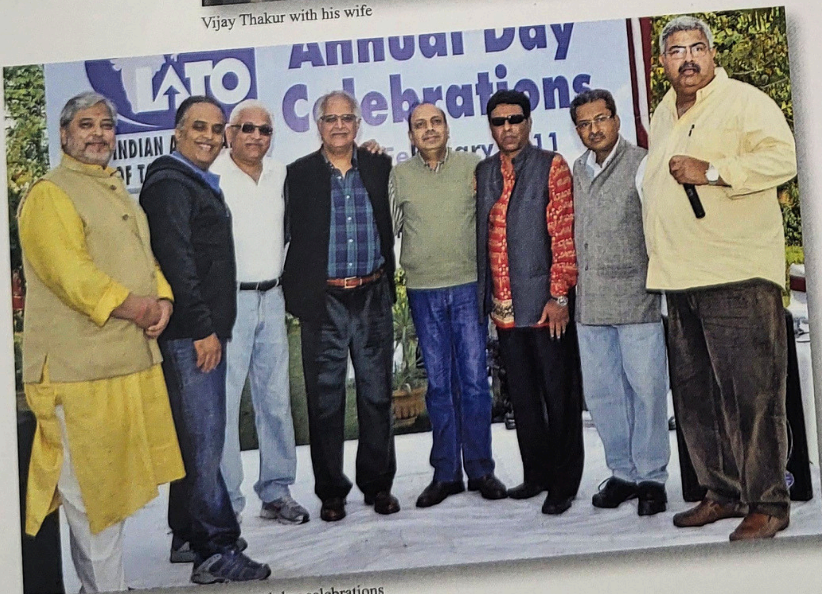
IATO members enjoying at the annual day celebrations